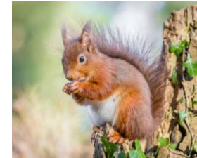
squirrel – drey