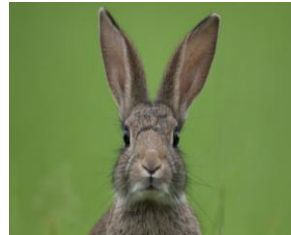
rabbit – warren