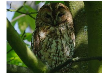
owl – tree