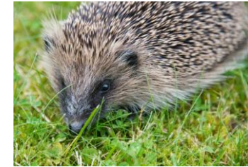
hedgehog – nest