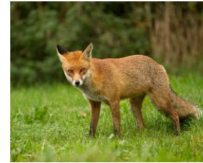
fox – den