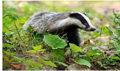
badger – sett