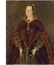
Lady Jane Grey. Ruled for 9 days in 1553. The Great-Granddaughter of Henry VIII.