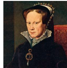
Mary I. Ruled from 1553-1558. Daughter of Henry VIII and Catherine of Aragon. Married the King of Spain, Philip II.