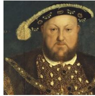
Henry VIII. Ruled from 1509-1547. Married 6 times and had 3 children: Mary, Elizabeth and Edward.