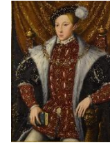
Edward VI. Ruled from 1547-1553. The son of Henry VIII and Jane Seymour. Never married.