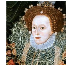
Elizabeth I. Ruled from 1558-1603. Daughter of Henry VIII and Anne Boleyn. Never married.