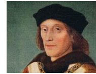
Henry Tudor (Henry VII)- Lancastrian

The Tudor Dynasty began in 1485 after Henry Tudor (Henry VII) defeated Richard III at the Battle of Bosworth . This battle was part of the War of the Roses (1455-85) which consisted of a series of civil wars fought between the houses of Lancaster and York, to see who would take the English throne.